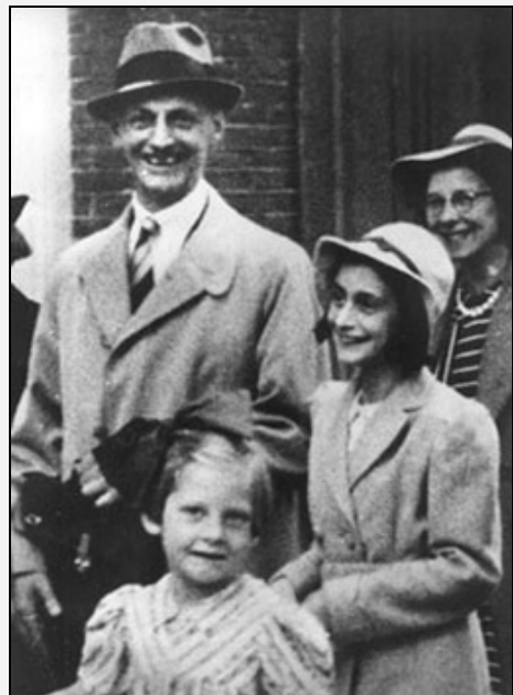
Anne Frank with Her Father, Otto Frank