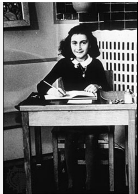
Anne Frank in School at Age 11