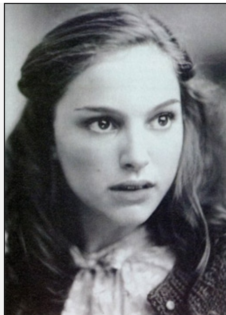
Natalie Portman, as Anne Frank in a Broadway Production of The Diary of Anne Frank

"In cooperation with Yad Vashem in Jerusalem the AFF founded the 'Anne Frank Medical Fund for the Righteous.' This provides urgently needed medical supplies to the "righteous" non-Jews who risked their [own] lives to help Jews [who were] persecuted during the Holocaust. Help with financing is also sought from third parties. Support is given to Israeli -