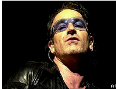
Bono has long been involved with African initiatives

Beyonce, Queen and Bono from U2 are to headline a huge concert in Cape Town, South Africa, to raise awareness of Africa's Aids plight.